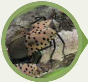
EGG LAYING SEP-NOV