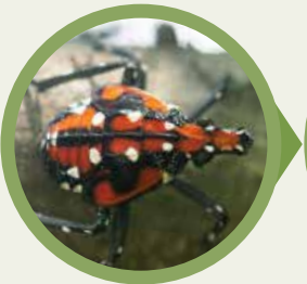
LATE STAGE NYMPH JUL-SEP