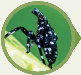
EARLY STAGE NYMPH MAY-JUL